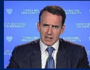
...Edward Glaeser Harvard

“The demand for ideas isn’t going away.”